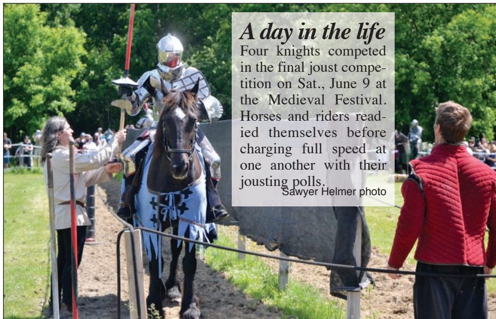
A day in the life Four knights competed in the final joust competition on Sat., June 9 at the Medieval Festival. Horses and riders readied themselves before charging full speed at one another with their jousting polls.

For both of the latter events, knights dressed in