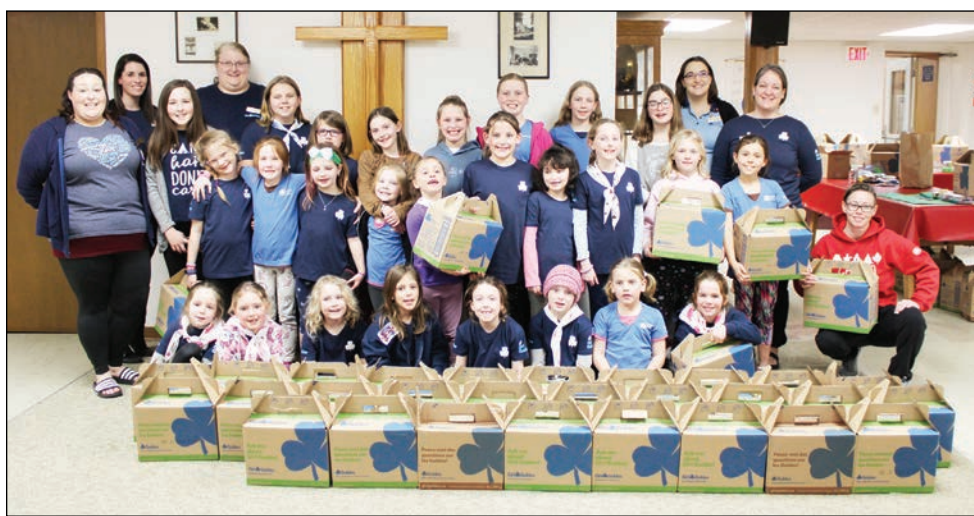
After spending an enjoyable evening putting together birthday boxes for Community Food Share, leaders and members of the 1st South Dundas Sparks, Brownies and Girl Guides gather for a photo with the boxes ready for distribution.