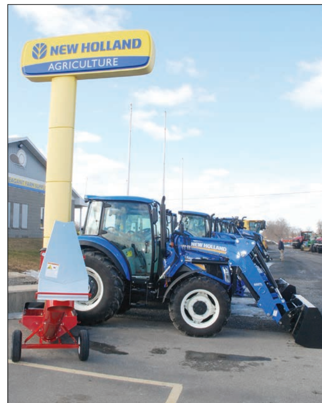
Weagant Farm Supplies has been operating in the Winchester area for more than 50 years. The new owner commends the region's "progressive customer base."