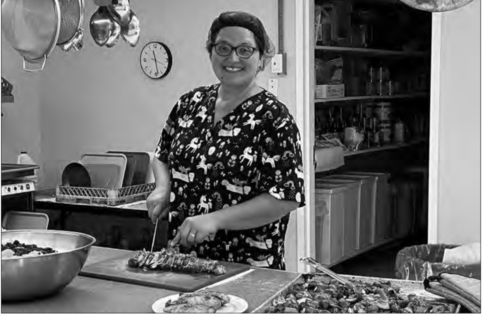
Carefor North-Stor Support Centre offers a variety of programs, services, and activities for seniors aged 55-plus, as well as adults with physical disabilities. The centre's cook is pictured preparing healthy food.

ingredients to prepare a dinner for two.