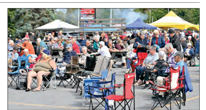
The crowd at Apple Fest 2022 grew throughout the morning, but it really began to fill up when the music began shortly after noon.

In Iroquois, as in so many small communities, it is the volunteers that make the difference!