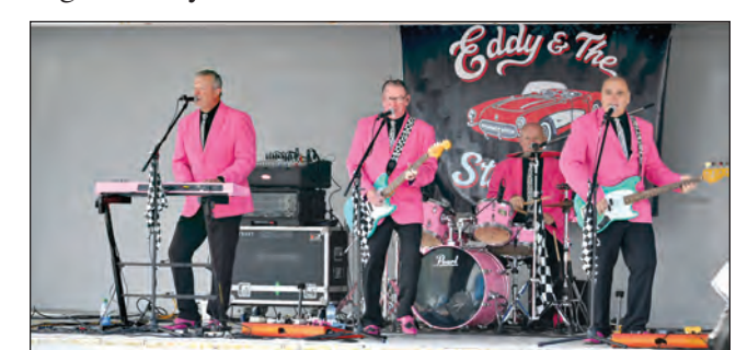
When Eddie and the Stingrays started playing, things really started jumping!