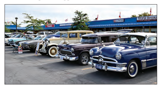
The Golden Gears Car Club was a big attraction at Apple Fest 2022 in Iroquois.